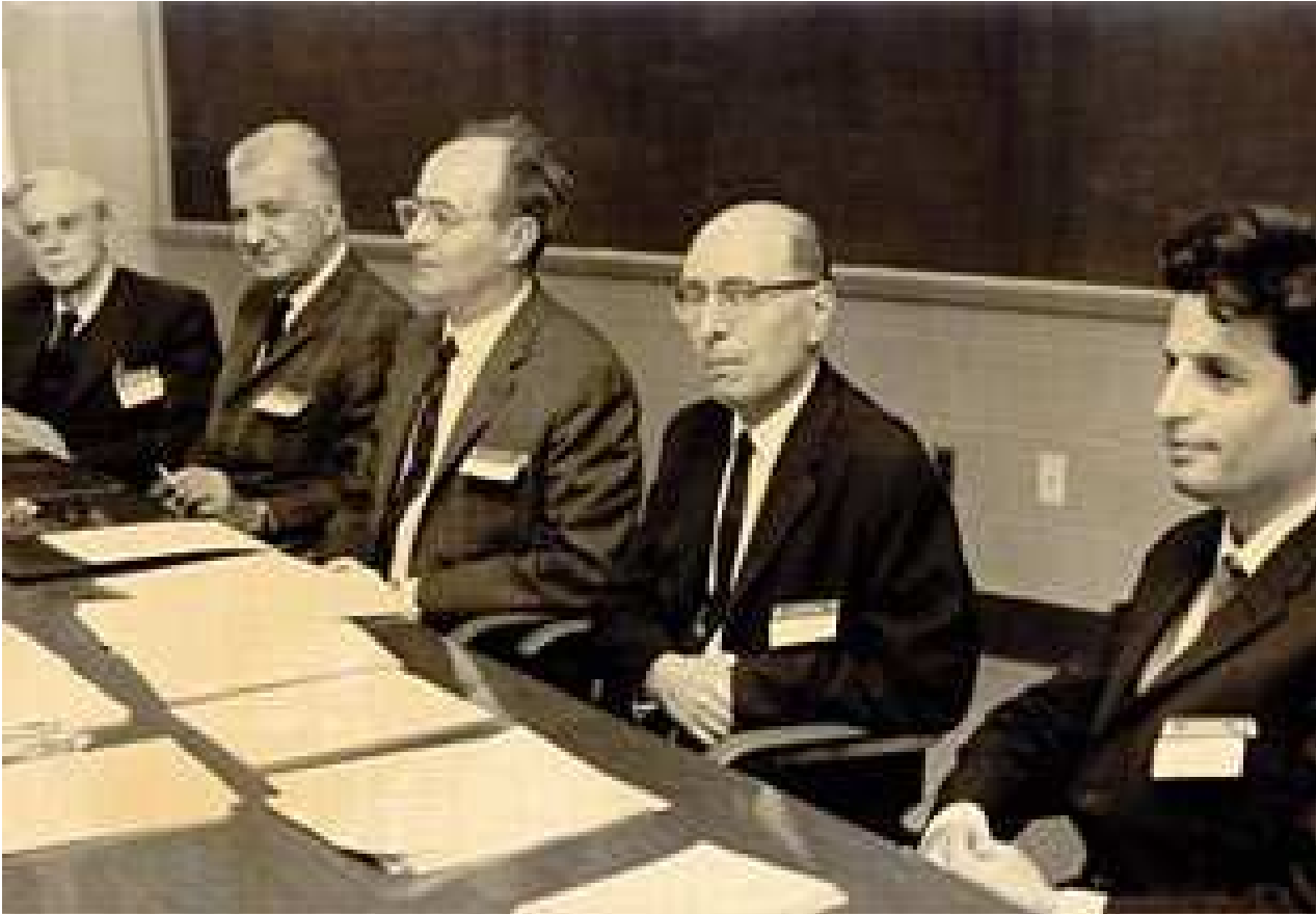
Paul Dirac Boris Podolsky W. Furry Eugene Wigner Yakir Aharonov